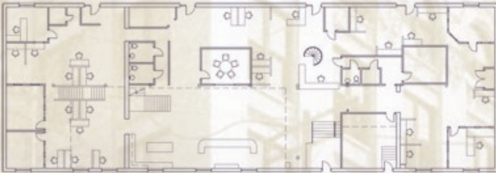
Floor Plan - Street Level